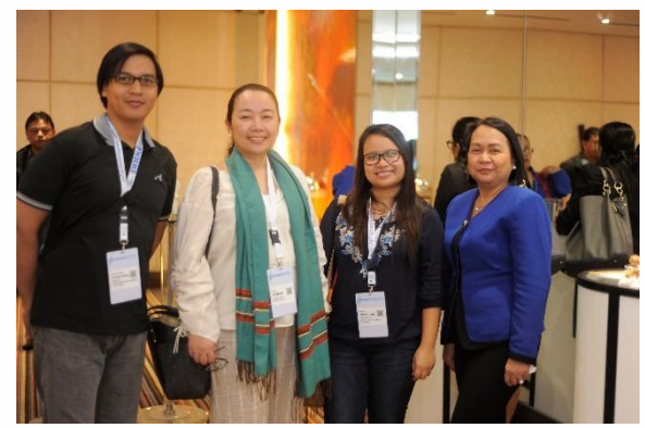
PNHRS Networking Cocktail Dinner August 23, 2017 Hotel Jen, Manila